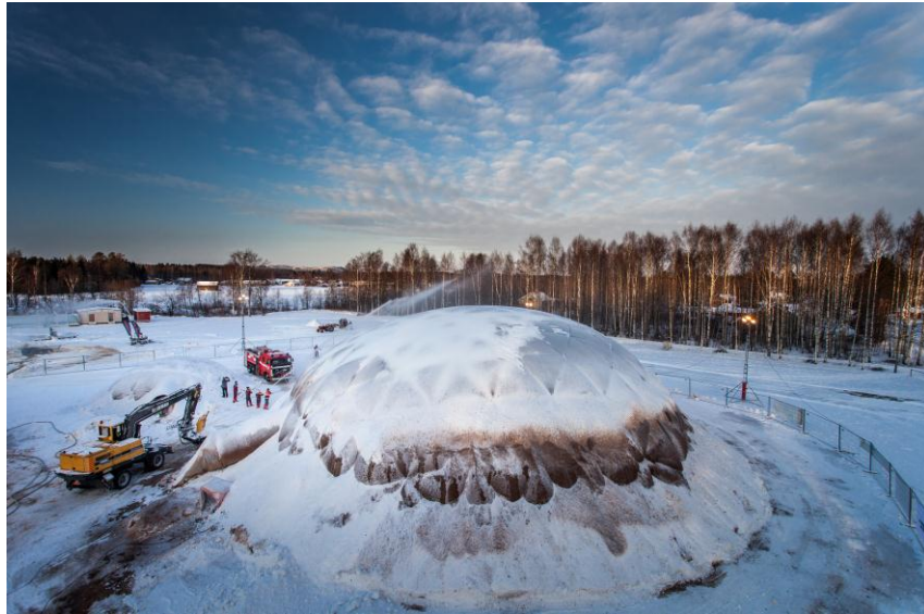
Figure 2. The 'Pykrete Dome' (photo by TU/e, Bart van Overbeeke).