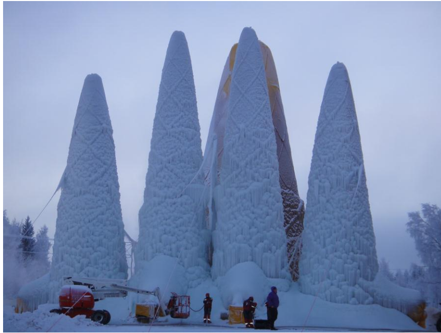
Figure 4. The 'Sagrada Familia in Ice'.