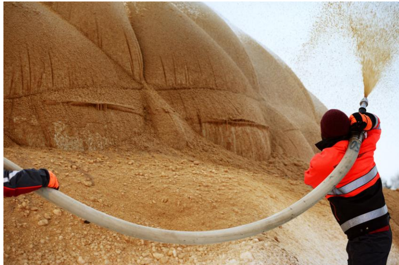
Figure 3. The spraying of pykrete.