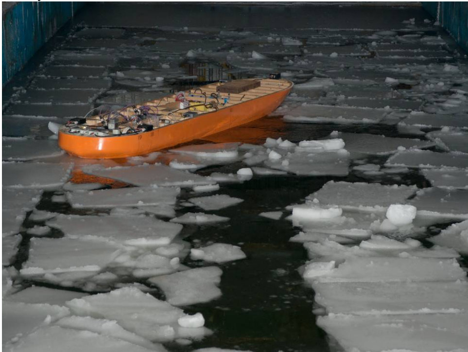
Figure 4. Optimization of ice management modeling techniques using icebreaker model in the ice basin

For this purpose special equipment was developed to be installed on the ship model under study for recording physical values, fixing model position coordinates as well as execution of real-time control functions. This equipment includes propulsion pods, model remote control panel integrated into the data monitoring and visualization system, model controls and radio-link unit for ship model position fixing (Figure 4). Underwater processes are viewed with assistance of a special remotely controlled submersible adapted for operation in cold and salty water.