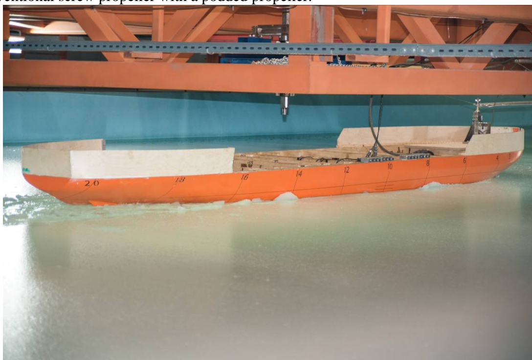
Figure 3. An icebreaker model test in the new ice basin of Krylov State Research Centre

Ship model tests often go hand-in-hand with the studies addressing the design of propulsion systems for icebreakers and ice-class ships under consideration. Special-purpose test rigs have been developed for the new ice basin to explore the interaction of various propulsors with ice including advanced propulsion systems like combinations of a conventional screw propeller with a podded propeller.