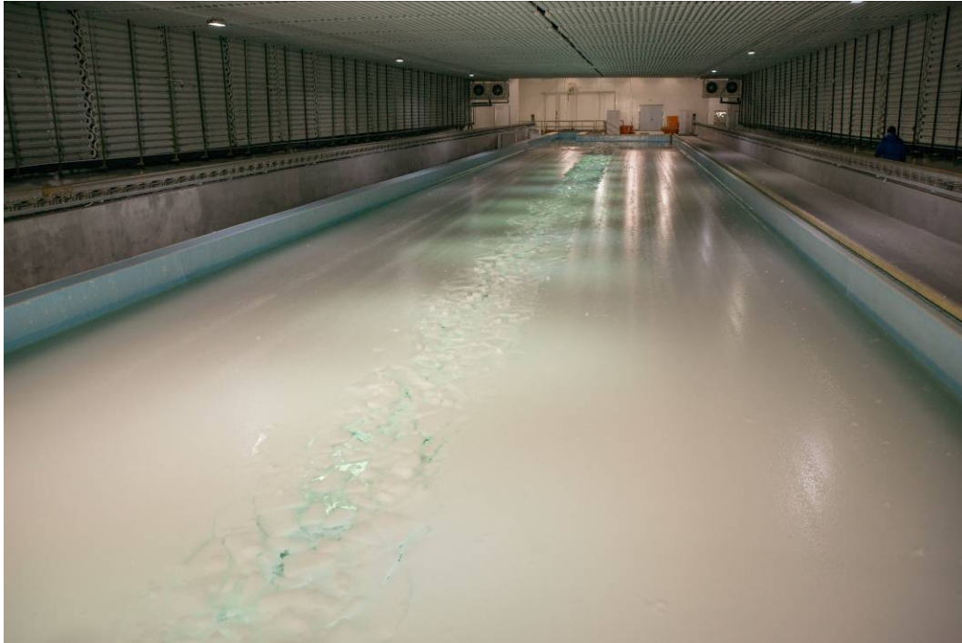
Figure 1. Fine-grained ice sheet, view of the Krylov new ice basin

A significant length of the new basin called for optimization of water supply to the auxiliary (service) carriage to avoid any ice in water supply hose or spray system during model ice making process. For solving this problem the ice laboratory engineers suggested a channel that should run outside and parallel to the basin bowl and be connected to the main water volume of the basin by a system of pipelines (Figure 2). The water depth in this channel should be about 0.5 m to prevent ice pieces getting into the pipe extending from the service carriage. A bubbling system was arranged on the channel bottom to aerate water and prevent ice formation on water surface. Thus, the model ice making process is going uninterrupted when the temperature in the room is sufficiently low.